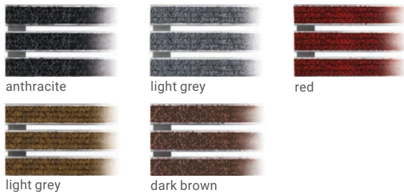
Illustration of colors not true to original. On request you receive original samples promptly. It's about rips colours. Single Brushes only available in black.